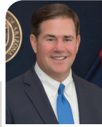
Gov. Doug Ducey