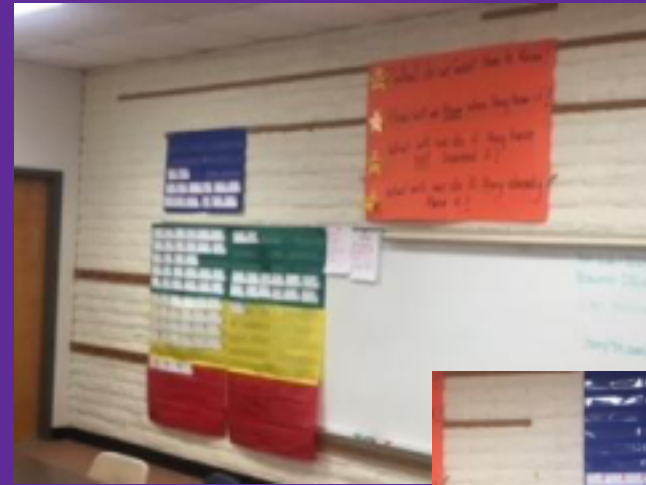
New Data Room

Additionally- Leadership Committee is adopting a “theme” of growth mindset for all at Pueblo